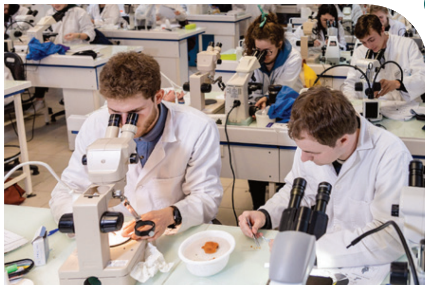
© ISFFEL - Mathieu Le Gall - SBR - SU - BLUE TRAIN