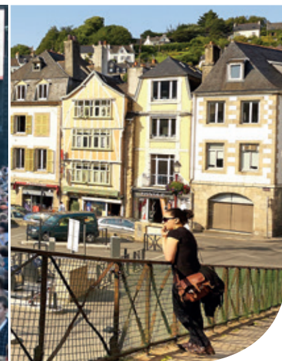
Morlaix town centre