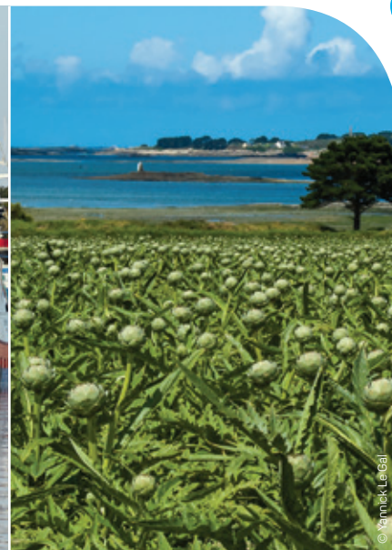
Field of artichokes